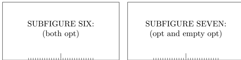
(f) Subfigure Six.